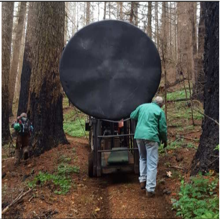
Left: The prototype tent platform for Nesika, which will be replicated many times. Right: The new 1500 gal. water tank on the journey to its new home.