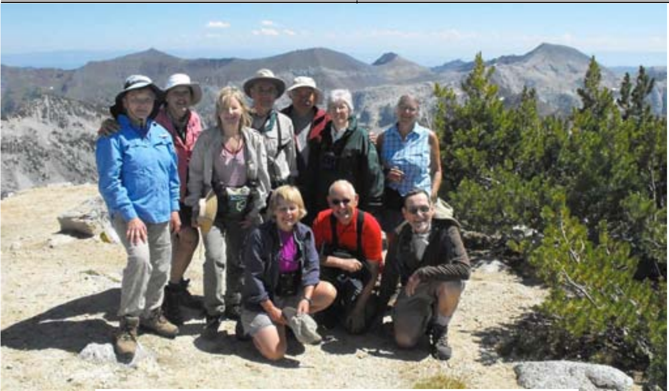
Entire Week 2 Wallows Alpine Outing group on Eagle Cap summit. Photo by Chrishelle Wingerd Bill Kingsbury